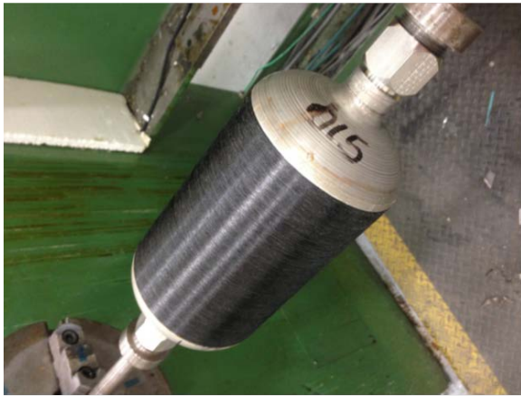
Figure 2. CNT-reinforced composite overwrap pressure vessel.

mechanical and electrical properties of CNT-based bulk materials, effective use of simulation and modeling to provide insight into CNT growth process, and the use of public-private partnerships or other collaboration vehicles to leverage resources and expertise to solve these technical challenges and accelerate commercialization. NNI agencies continue to address these challenges through a combination of intramural and extramural research programs, interagency collaborations, and collaborations with industry and academia. One outcome was the establishment of the Institute for Ultra-strong Composites by