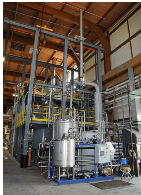
Figure 3. Forest Products Laboratory nanocellulose pilot plant.